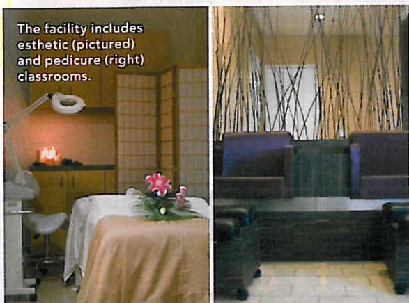
The facility includes esthetic (pictured) and pedicure (right) classrooms.