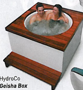
HydroCo Geisha Box