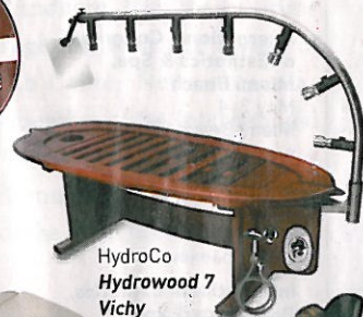
HydroCo Hydrowood 7 Vichy