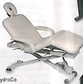
HydroCo Sphinx treatment table